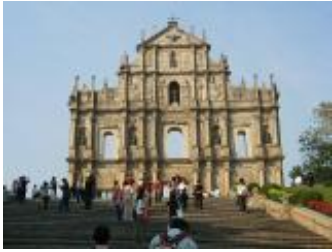
Our most recognized landmark the Ruins of St. Paulo, Macau