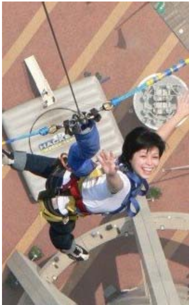
Bungee Jumping – CN Tower