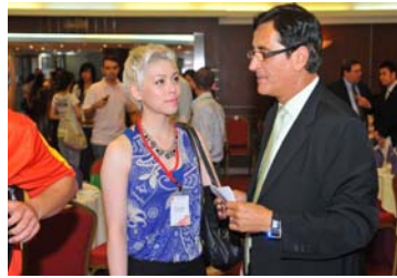
Interviews at the Youth Encontro in Macau – 2009