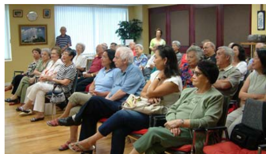
the captive audience