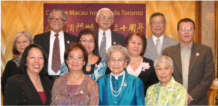
Executives and some members of Social Committee