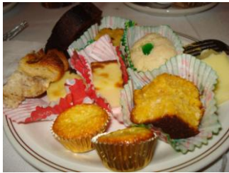
Homemade Macanese desserts

Around 10:45 p.m. it was time for the Sweet Table. There were mountains of dessert and they were set out on long tables. Though the banquet hall provided the usual sweets, the thrust was towards the home-made goodies (photo below), all made by volunteers. Meanwhile, the dancing continued, the line-dancers "performed" as they do at almost every party.