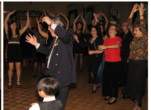
Watch out...somebody catch Dancer!