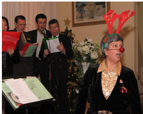
"Come Dasher and Dancer and Prancer and Vixen !!!!!!"