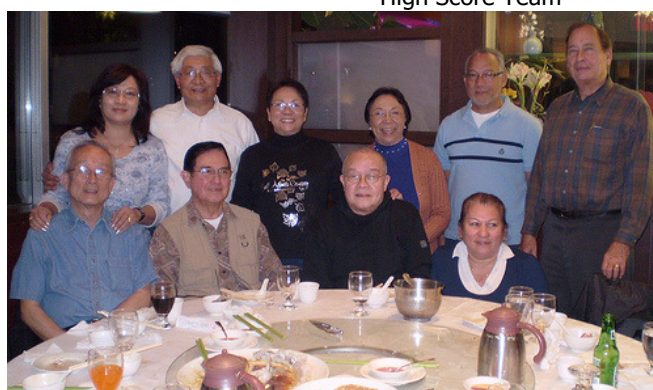
Members enjoying dinner after Bowling