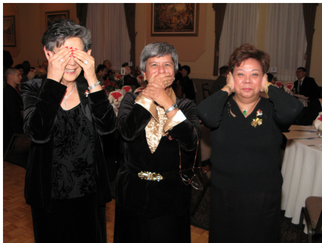
Outgoing Executive reacting to announcement of a public enquiry...