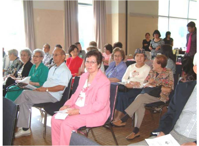
Members waiting for Mass to start