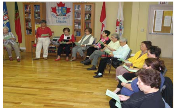
... more of the flock