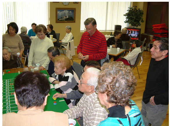
Place your bets everyone

Some forty members gathered at the clubhouse March 29 ready to play the odds at the Dai Sai table which our Social Committee had set up. Those wishing to participate, contributed to the “pot”/bank and bought more chips with which to play. In a relaxed atmosphere, members either placed their bets or chose to abstain if they had a run of bad luck while others sat and socialized. Come dinner time, there was a lovely spread of different kinds of noodles that was enjoyed by all. After dinner and dessert the betting continued until dusk. Casa participated in observing the one hour switching off of the lights from 8 pm – 9 pm as part of Earth Hour. At each table there were pillar candles which were lit for the one hour observance. From the windows of the Casa it was encouraging to see how some neighborhoods did seem to also be observing Earth Hour. Let's hope that this will not just be a gimmick but rather will foster awareness for conservation. (See more photos posted on the website.)