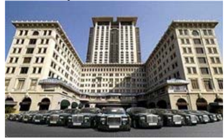
The Peninsula's new 37 storey extension (the tall tower) opened in December 1994.

The decision to build the hotel was made in 1921 and construction of the $3 million, nine-storey edifice began in 1923. It included a shopping arcade, theatre and rooftop-garden, while the famous entrance incorporated a wide carriage-way around the fountain. The Hotel's 250 rooms came with telephones, box-spring mattresses and adjoining bathrooms. The Peninsular stood as a landmark in the history of a great city of the future, said the colonial secretary.