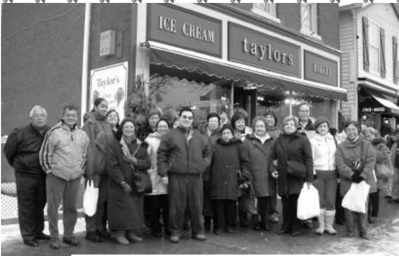
Christmas Lights Group in Niagara -On-The-Lake