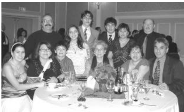
The Vieira family at Casa's Christmas party