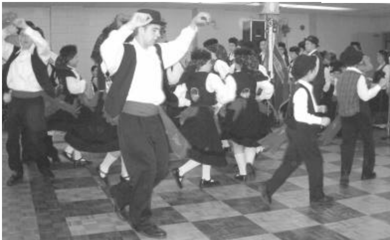
"As Tircanas" the Portuguese dance group which provided the 'entertainment' for the evening.

members with many successful events over the years.