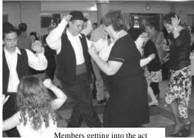
Members getting into the act