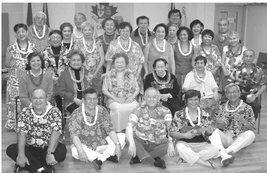
Attendees in their best Hawaiian outfits (Unfortunately latecomers missed being included in the photo)

In the hopes of snapping us all out of the doldrums of winter, the Social Committee hosted a get-together at the clubhouse on March 27 th . The theme chosen was